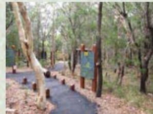
Outdoor Sensory Trail